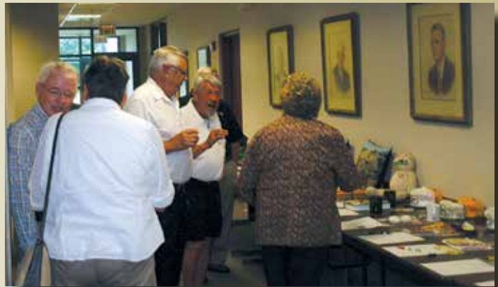
DEKALB memorabilia assembled for Alumni's annual auction

Items donated were very similar to previous years, but they continue to be of much interest, including the DEKALB plates. Three plates brought a total of $145. Lots of bidding on a DEKALB blanket, a semi-truck, a Chix Too sign and on a DEKALB winged ear. Other items included caps, jackets, pens, pencils, pillow, belt buckle, bank bag and cookie cutter.